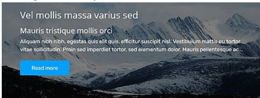
Hero image with overlay