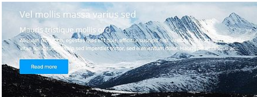
Hero image without overlay

The difference on the front end could look like this: